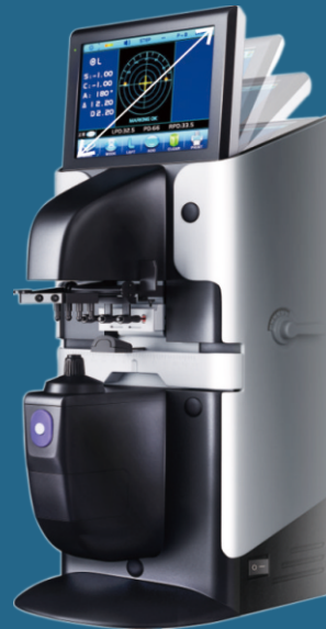
5.6"LCD JD 2600B(D 903)