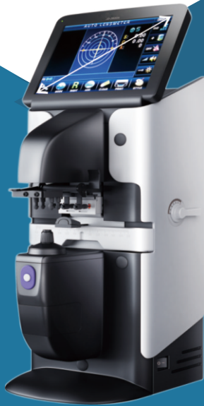
7"LCD JD 2600A