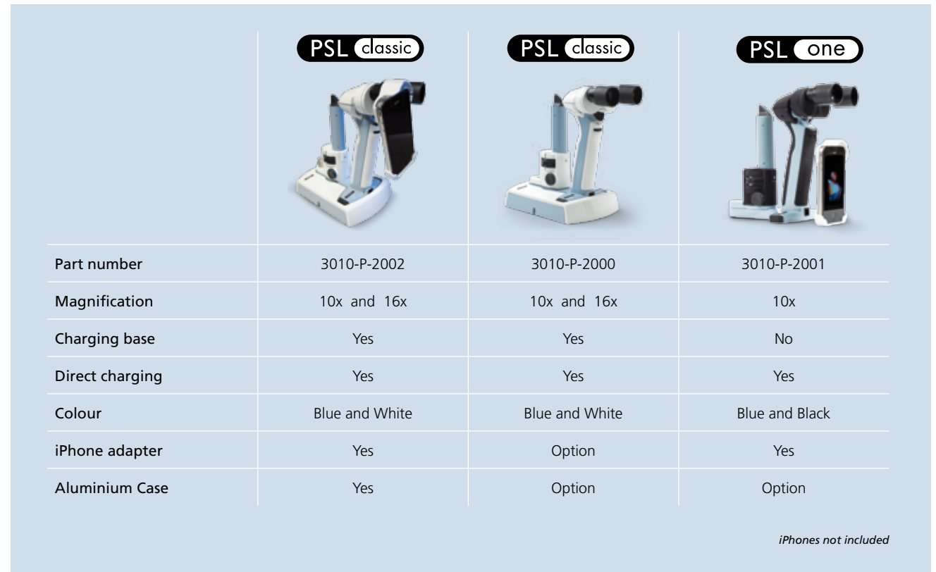
iPhones not included