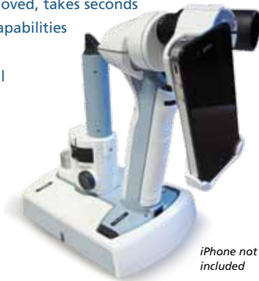
iPhone not included