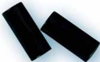
Rubber Handle Sleeves Part Number 1901-P-7028 Pink 1901-P-7036 Green 1901-P-7044 Blue EP29-05365 Black