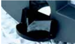
All Pupil II Teaching Mirror Part Number 1202-P-7117