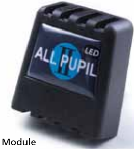
All Pupil II LED Module