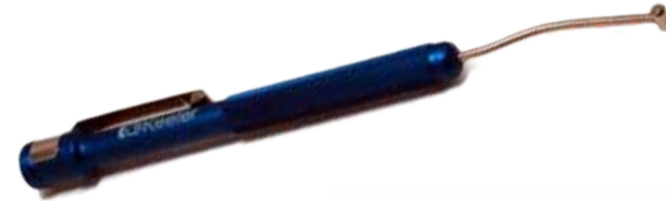
Pencil Type, Small and Large Depressors Part Numbers 1201-P-6076 Pencil Type 1201-P-6075 Small 1201-P-6067 Large