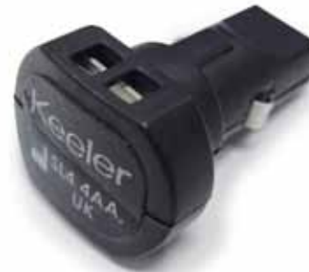
Vantage Plus LED Module