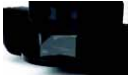
Vantage Plus Teaching Mirror Part Number 1202-P-7205