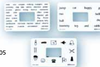
Near Point Cards for Retinoscopy Part Number 1321-P-7005